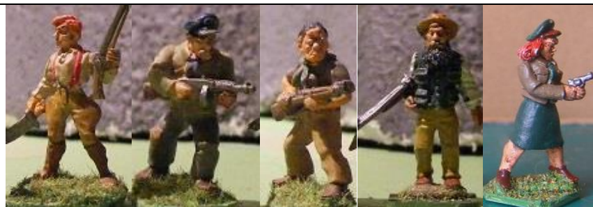
Noah Rhett Pipzi Lenny Strawberry

Many years before the film “King Kong” was made the great fim maker, Curly Toanayles needs to finish his movie and has found the perfect location; Skull Island. He found an unknown singer and dancer as his leading lady to play opposite the star Noah Peele. This 'soon-to-be-unfortunate' soul is Sue Flaye. No one knows what they will encounter on this island and why it is so mysterious, but once they reach it, they will soon find out. Living on this hidden island is a giant gorilla and this beast now has Sue in its grasp. You must travel through the jungle looking for Kong and Sue , whilst avoiding all sorts of dangers, creatures and beasts.