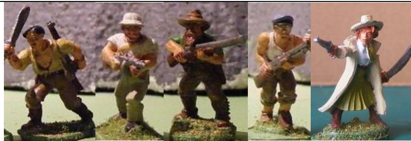
Curly Snowy Hairy Mucky Ginger

Many years before the film “King Kong” was made the great fim maker, Curly Toanayles needs to finish his movie and has found the perfect location; Skull Island. He found an unknown singer and dancer as his leading lady to play opposite the star Noah Peele. This 'soon-to-be-unfortunate' soul is Sue Flaye. No one knows what they will encounter on this island and why it is so mysterious, but once they reach it, they will soon find out. Living on this hidden island is a giant gorilla and this beast now has Sue in its grasp. You must travel through the jungle looking for Kong and Sue , whilst avoiding all sorts of dangers, creatures and beasts.