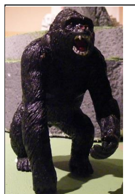
Kong , large teeth SDD-1, Fists SDD -2