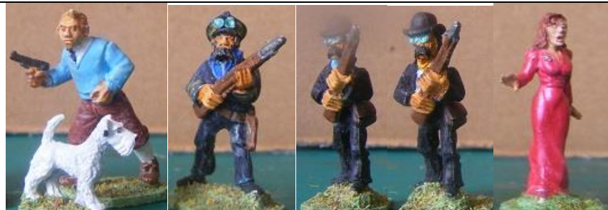
Tintin & Snowy Capt Haddock Thompson Twins Bianca

Many years before the film “King Kong” was made the great fim maker, Curly Toanayles needs to finish his movie and has found the perfect location; Skull Island. He found an unknown singer and dancer as his leading lady to play opposite the star Noah Peele. This 'soon-to-be-unfortunate' soul is Sue Flaye. No one knows what they will encounter on this island and why it is so mysterious, but once they reach it, they will soon find out. Living on this hidden island is a giant gorilla and this beast now has Sue in its grasp. You must travel through the jungle looking for Kong and Sue , whilst avoiding all sorts of dangers, creatures and beasts.